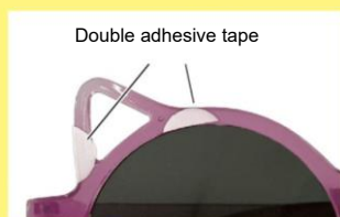
Double adhesive tape

* Cut the adhesive stickers into small pieces.